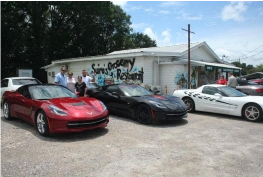
July 25, 2020 Cruise to Suire's by Scotty Quebedeaux.

Trivia Answers: 1. Harley Earl 2. Heater 3. 1970 Bonus: Cadillac